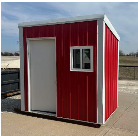
Portable Ticket Booth- This project was started from scratch. We built a portable building that could be used as a ticket booth, concession stand, snow cone dispensary, or somewhere for teachers to hide from students. Just kidding. We learned how to frame, install insulation, basic wiring for plug-ins and light switches. We also learned how to side and roof using metal. Door and window installation was learned also.