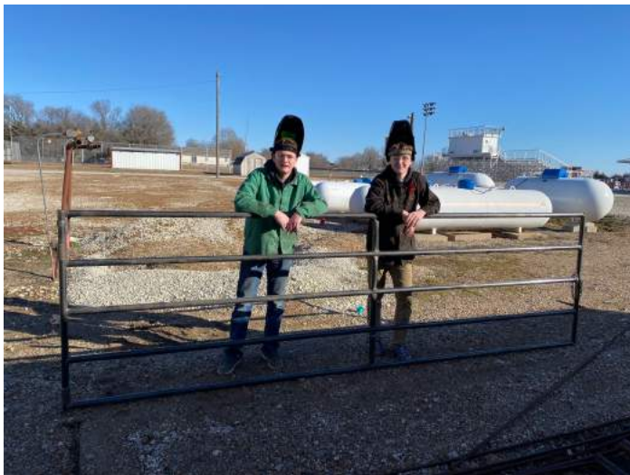
First corral gate from our newly made gate and panel jig.