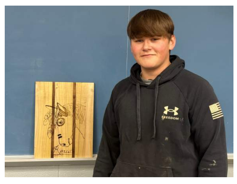
Callum Reust—Cutting Board with Wood Burned War Horse