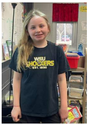
Chip on your shoulder