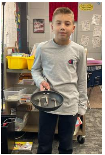
Bigger fish to fry