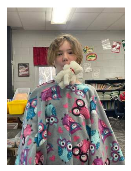
Cat got your tongue