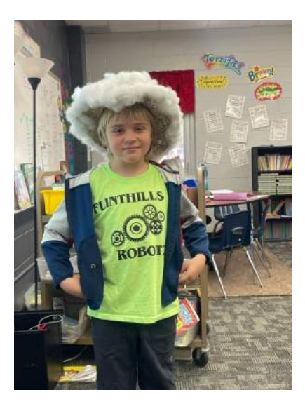
Head in the clouds