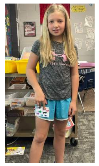
Ants in my pants