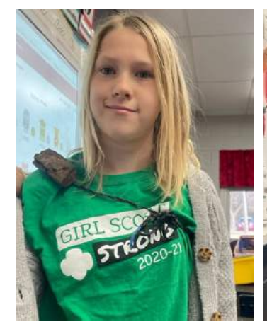
Chip on my shoulder