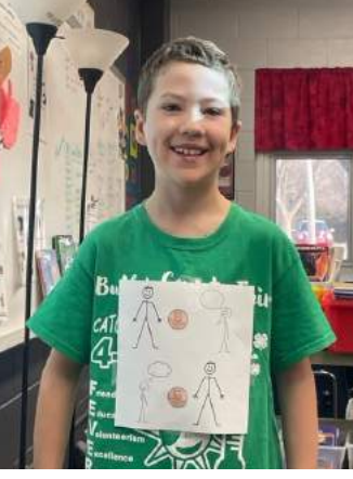
Penny for your thoughts