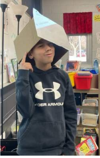
Thinking inside the box