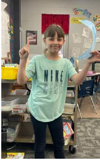
Once in a blue moon