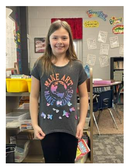
Butterflies in my stomach