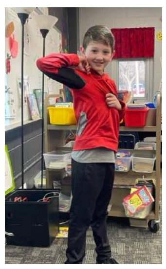
The gray area