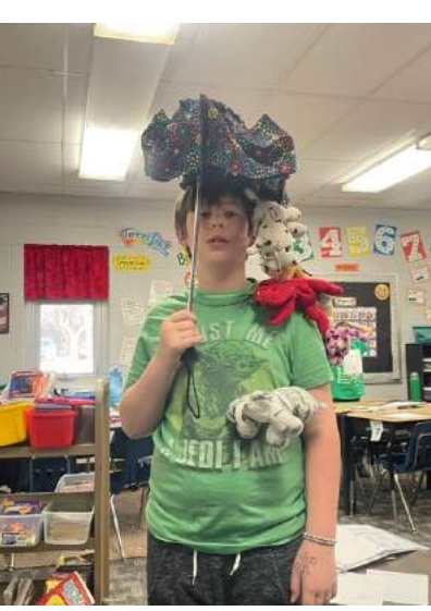
Raining cats and dogs