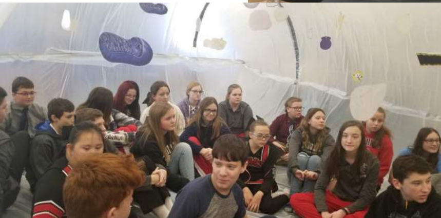
The classes enjoyed this because it brought science to life.