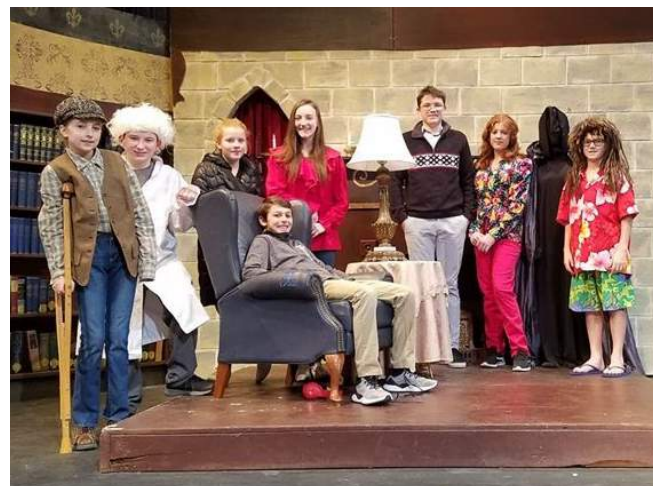
Dream to Believe Cast Picture from Left to Right (Back Row):