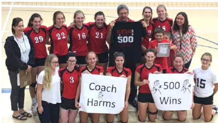
Coach with the team after his 500th win!