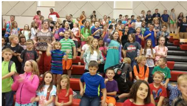
Cheering on our Flinthills Mustangs state qualifiers at the pep assembly!