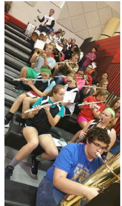
The band played some tunes and beats at the pep assembly to get the student body pumped up for state volleyball and cross country!