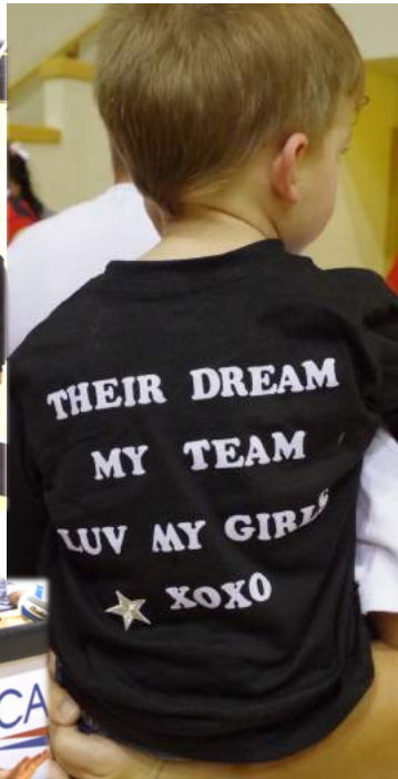
The crowd showing support with game point at State!