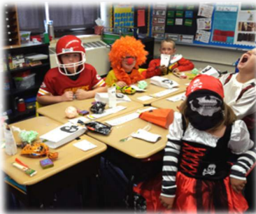
2nd Grade class party