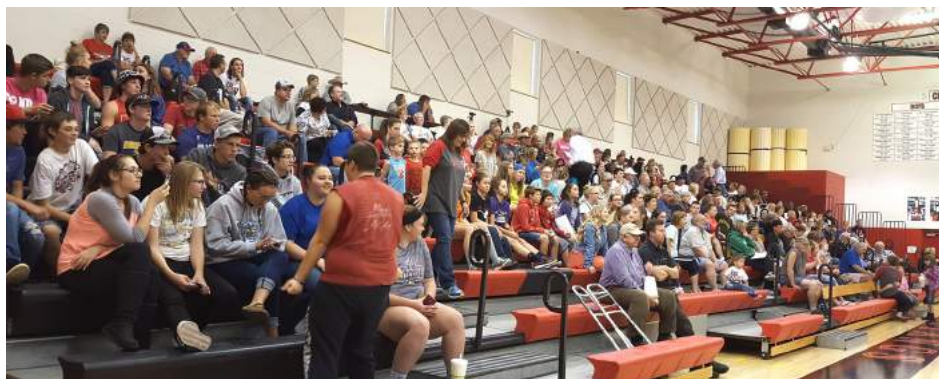
The crowd was ready to cheer on seniors and celebrate 500 wins and counting!