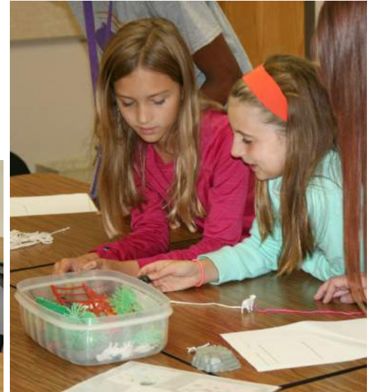
More photos can be viewed on our website, www.usd492.org .